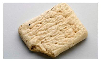
Ship's biscuit - ANMM collection

Possibly the most troubling issue relating to food was cannibalism among some of the tribes the crew encountered, eg the Maori in New Zealand. Fortunately no-one on the Endeavour met with this fate.