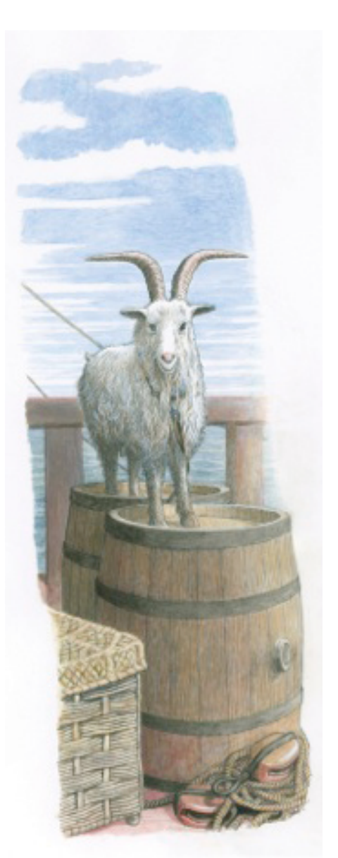
Ship's goat on a barrel