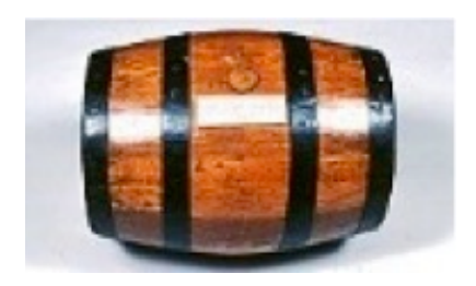
Cask of rum- ANMM collection

Every man had to provide his own bowl, spoon and mug and would put his own mark on these. (Some typical items were wooden tankards, bowls, cheap pewter and china mugs). Cook believed that the use of chou croute or sauerkraut, cabbage preserved in brine and rich in potassium, phosphorous and vitamins preserved by fermentation, preserved food. Scurvy, the result of lack of vitamin C, was common amongst sailors who did not have enough fruit and vegetables. Cabbage was one vegetable that purportedly helped