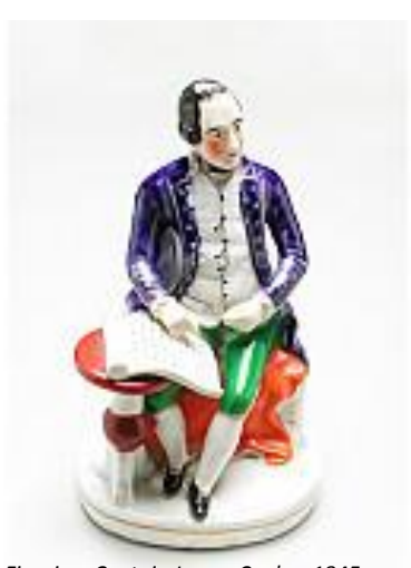
Figurine, Captain James Cook c 1845 Staffordshire Pottery ANMM Collection

This glazed porcelain figurine of Captain Cook was produced by the Alpha Factory in England. High quality porcelain figures were popular items to decorate the home and often commemorated notable British celebrities.